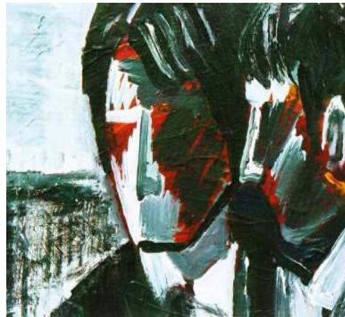
Mourners At Funeral