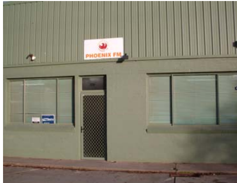
Our Building 128 Reservoir Road

A year later the premises have well and truly become our home with a steady stream of presenters and members coming to the building as well as people who come to be guests on our programs