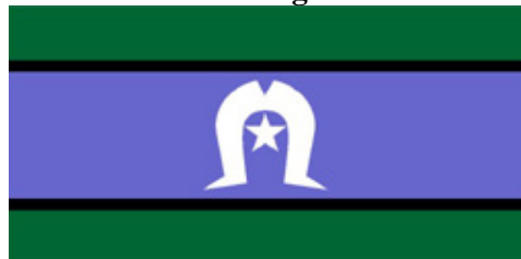
The Torres Strait Islands Flag

Many of our regular visitors to Phoenix FM may have noticed that there are (supposed to be) three flags on the windowsill in the reception area. The flags proudly displayed there are our Australian Flag, the Aboriginal Flag and occasionally the Torres Strait Islander Flag. In events which some of our presenters have likened to the X Files, firstly the Torres Strait Islander Flag seemed to develop a life of its own and kept turning up all over the studio premises only to be put back where it belonged. This happened several times over a number of weeks but eventually