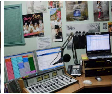
Our Main Panel