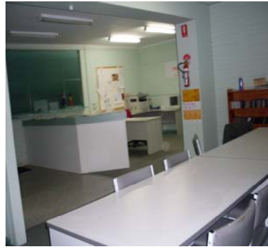
Our Office/Reception Meeting Area