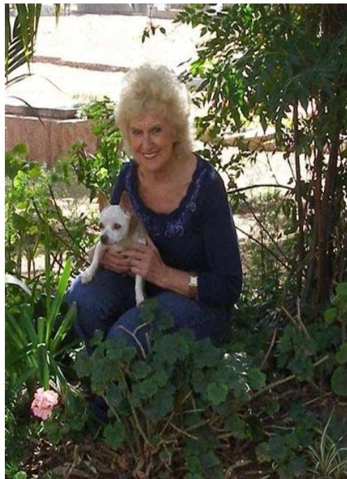
Floreana and Squirt - 2008